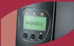
Upgraded Graphic LCD