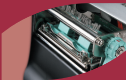
Modular concept printhead